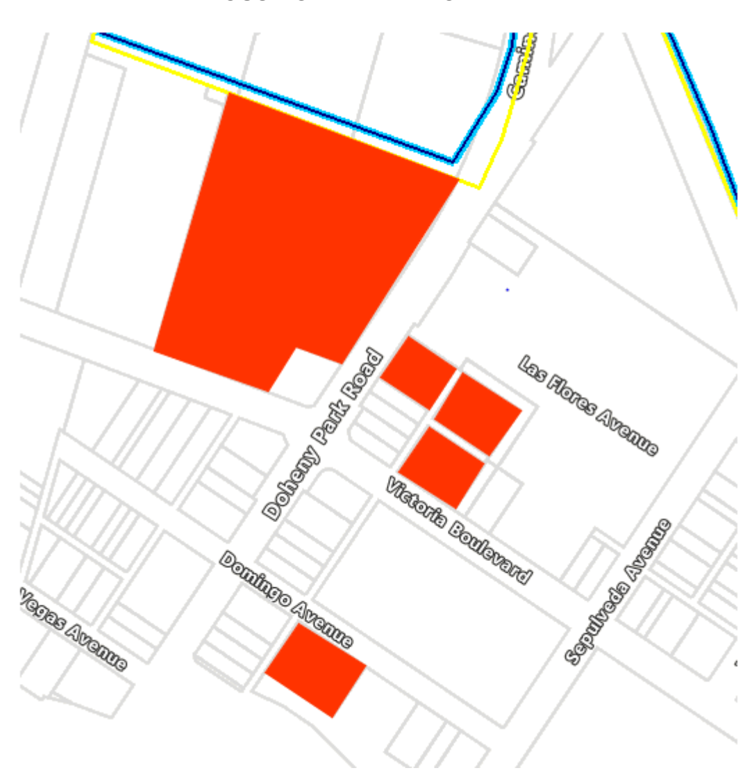
EXHIBIT A HOUSING INCENTIVE OVERLAY

split-zoned as Community Facilities District and Recreation District, with no changes to allowable uses and development standards as specified in Chapter 9.19 and Chapter 9.21.